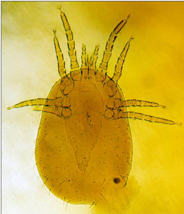
Figure 4. Northern fowl mite.

The adult female mite lays eggs on the host bird. Depending on the temperature and humidity, the eggs will hatch in 1 to 2 days. The larvae that hatch from the egg do not feed, and molt to the nymphal stage in about eight hours. The nymph