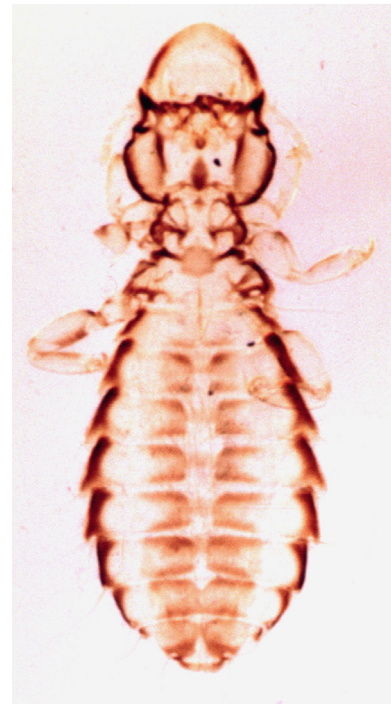
Figure 3. Chicken head louse.