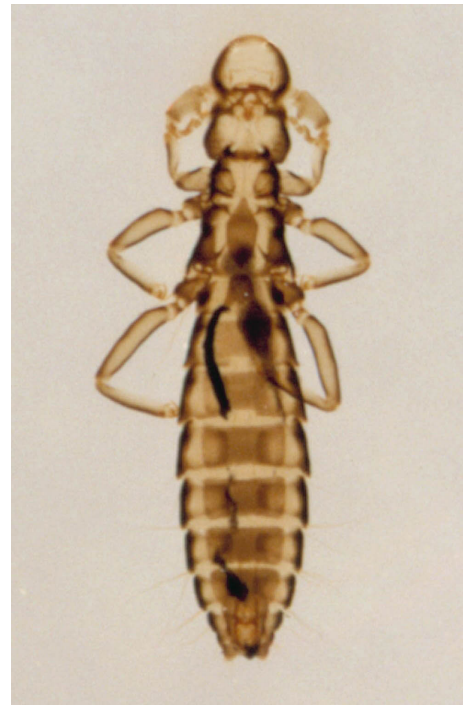
Figure 2. Wing louse.

The mites that attack poultry have similar life cycles, with four stages: egg, larva, two nymphal instars, and adult. The