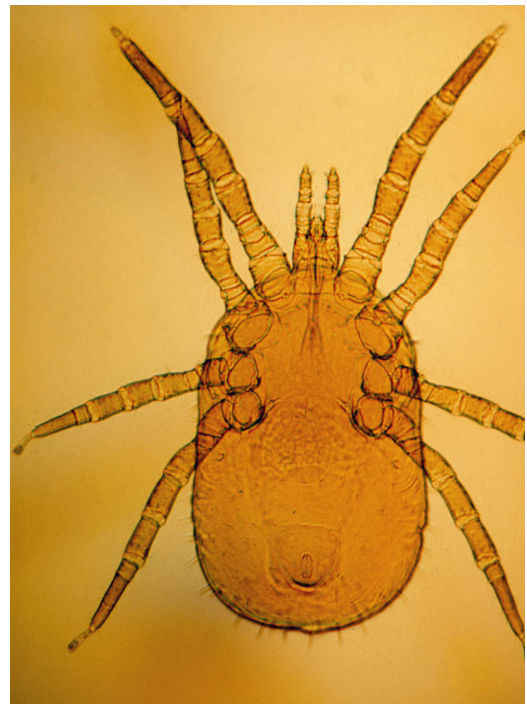
Figure 5. Red chicken mite.

The red mite hides in cracks and crevices during the day and crawls onto the host at night for a blood meal. The life cycle is similar to that of the northern fowl mite and also can be completed in as little as 7 days. Premise treatments and bird treatments will both aid in the control of this mite because much of its life is spent off the host.