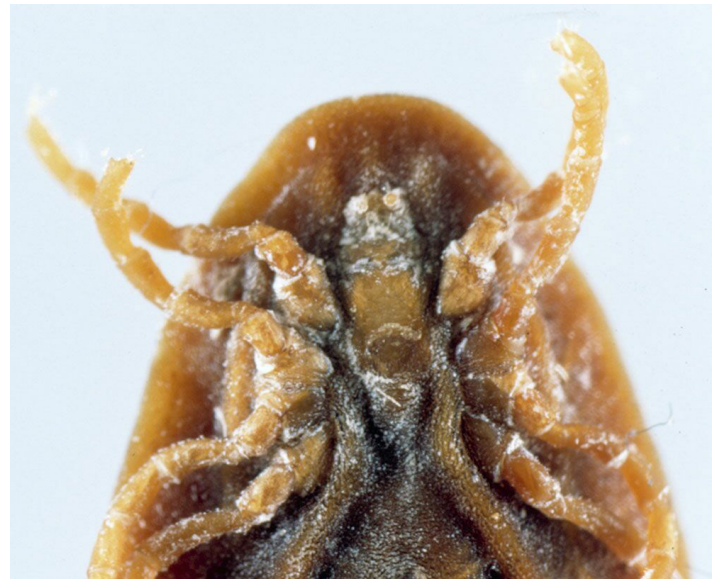
Figure 7. Fowl tick.

The female tick lays 25 to 100 eggs at one time in clumps, and one female may produce as many as 700 eggs in her lifetime. The eggs hatch in 1 to 4 weeks into larvae that climb onto the birds for a blood meal. The larvae remain on the host up to five days, until fully engorged. The feeding sites become severely irritated after extended feeding. The larvae drop off the host and molt into the nymphal stage about 7 days after hatching. The nymphs blood-feed and molt 3 to 4 times before maturing to the adult stage. After each feeding the tick returns to its hiding place. At night there is often movement of large numbers of ticks from hiding places to hosts and back.