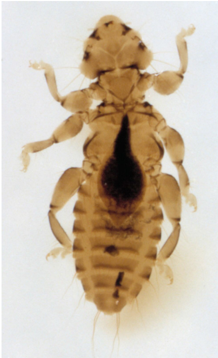
Figure 1. Shaft louse.

infest ducks, turkeys and guinea hens if they are housed close to infested chickens.