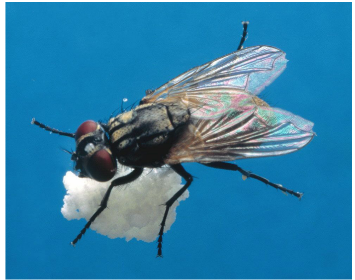
Figure 10. House fly.

House fly eggs are laid in almost any type of warm organic material; however, poultry manure is an excellent breeding medium. Fermenting vegetation such as grass clippings and garbage also provide a medium for fly breeding. The white