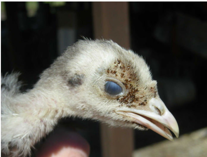
Figure 9. Sticktight fleas on a turkey chick.