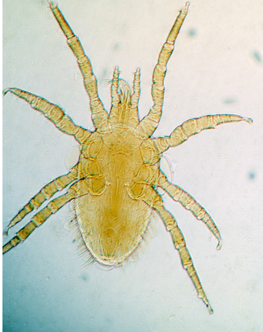
Figure 6. Tropical fowl mite.

The tropical fowl mite (Figure 6) is widely distributed in South America, the Caribbean and southern United States. It is a mobile species and will feed during the day or night. Besides domestic fowl, the tropical fowl mite prefers English sparrows and transmissions from wild birds to domestic fowl are quite common.